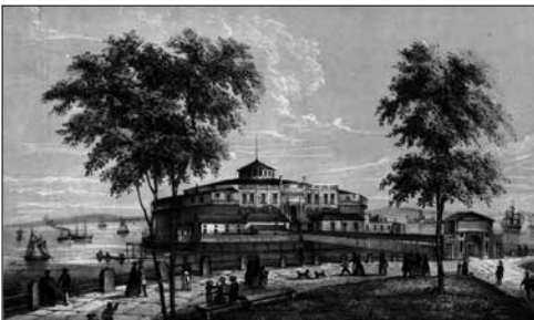
Castle Garden in Battery Park, where the Orchestra performed the US Premiere of Beethoven's Ninth Symphony