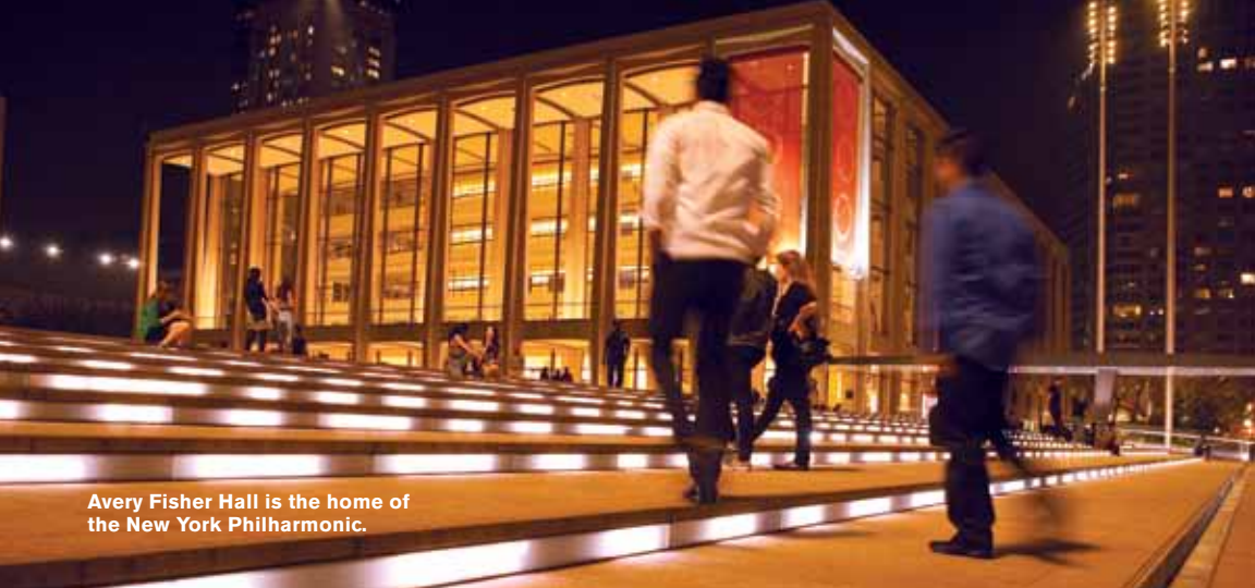
Avery Fisher Hall is the home of the New York Philharmonic.